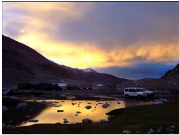
Namtso Lake /Tibetan Woman/Yamdroktso Lake

Day 6 Gyantse-Shigatse: On the way to Shigatse have a mountain village family visit for a glimpse of everyday Tibetan life. Drive to Shigatse to visit Palcho monastery, this monastery famous that its remarkable feature accommodates the three sects of Tibetan Buddhism in one monastery coexisting in peace with each other. The Palcho Monastery is in coexistence of the three sects namely, the Sakya, the Kagyu and the Gelug. ON Shigatse.